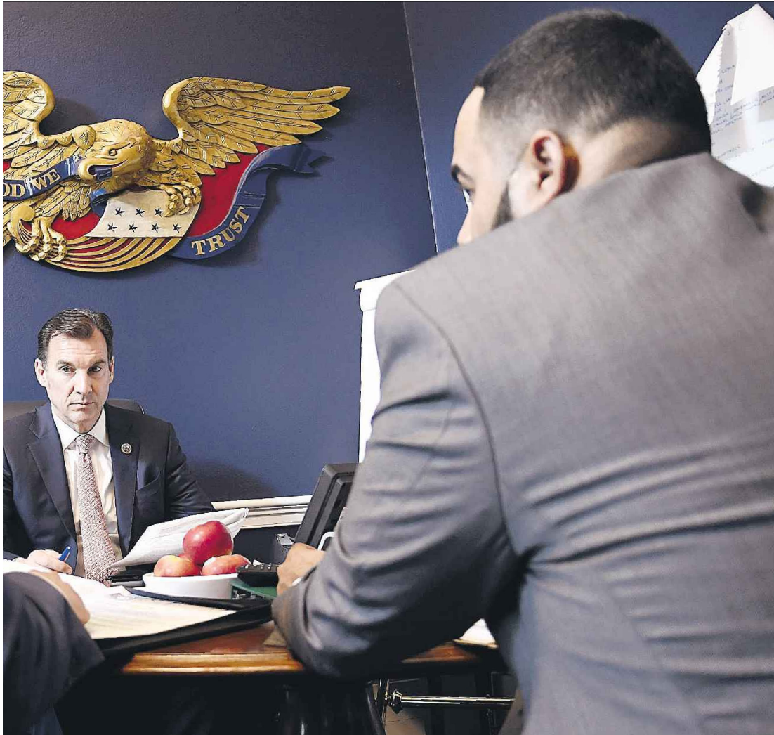
Boilermakers Local Lodge No. 5 from New York in his office at the U.S. Capitol on April 26.

general feeling that Congress has to really work together — then when you truly try to do that, you're accused of being a traitor to your party and beliefs," said King, whom the nonprofit Lugar Center — a Washington think tank formed by former Indiana Sen. Richard Lugar — and Georgetown University's McCourt School of Public Policy recently named as the most bipartisan member of the House, based on sponsorship and cosponsorship of legislation.